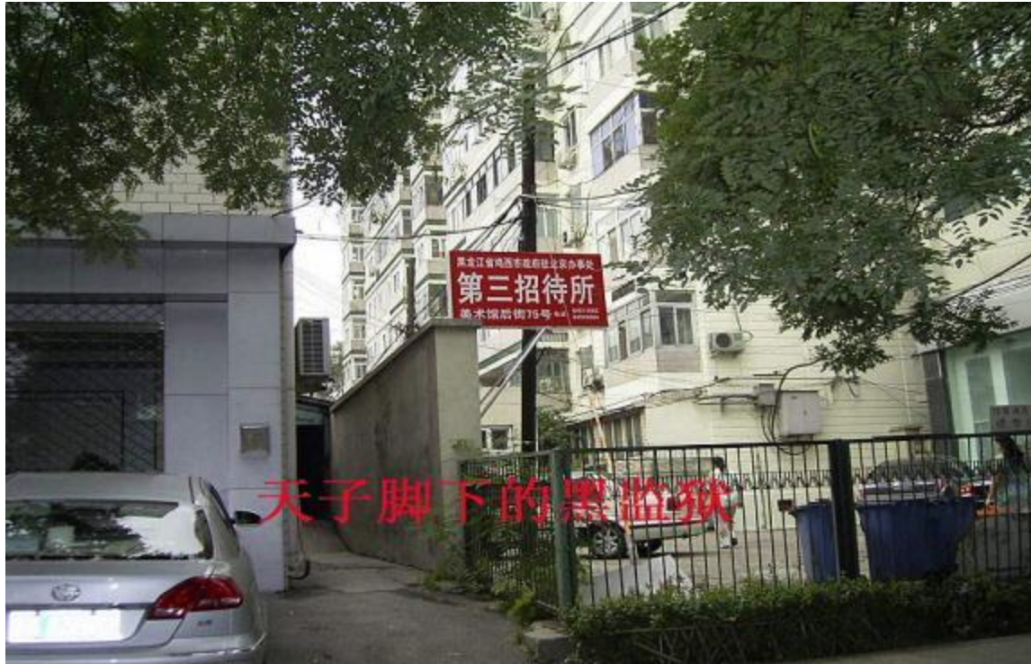
Pic 3: Black Jail managed by Beijing liaison office of Jixi City, Heilongjiang Province

Web: http://www.chrdnet.com/ Email: contact@chrdnet.com Promoting human rights and empowering grassroots activism in China