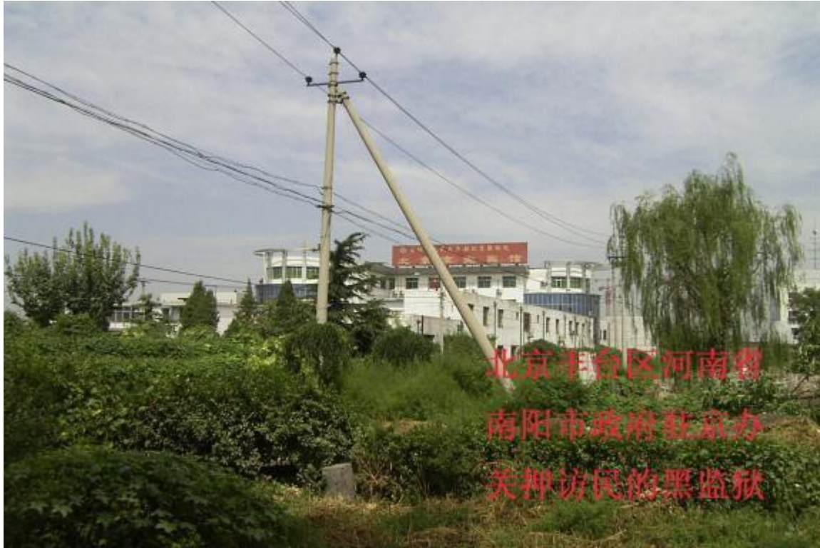
Pic 1: Black jail run by the Nanyang City, Henan Province Liaison Office