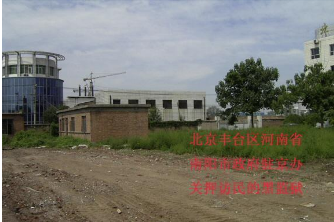
Pic 2: Black jail run by the Nanyang City, Henan Province Liaison Office

Web: http://www.chrdnet.com/ Email: contact@chrdnet.com Promoting human rights and empowering grassroots activism in China