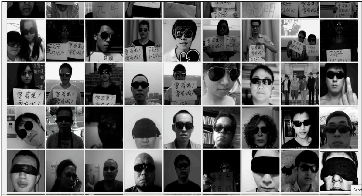
Another online initiative in support of Chen Guangcheng invites netizens to take portraits of themselves wearing sunglasses and posting them online. The picture above comes from http://ichenguangcheng.blogspot.com/ .

CHRD urges foreign diplomats and foreign journalists in China to challenge the government by requesting it to provide security for them to visit Dongshigu Village to verify the claim that Chen and his family are “free” and living “a normal life.” If a diplomat or journalist is assaulted or physically prevented from seeing Chen, an official complaint should be lodged with the Chinese government and a demand made that those using violence to obstruct such visits be held criminally accountable.