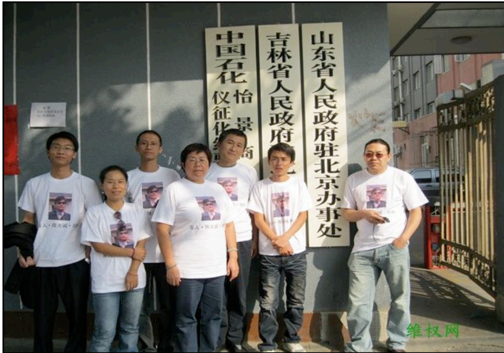
Members of Chen Guangcheng Concern Group wearing t-shirts with his portrait in front of the Shandong Liaison Office in Beijing

[We] must be absolutely nonviolent and we must not fight back. This time, we give up our legitimate right to defend ourselves. Hopefully, with completely peaceful and nonviolent means, we can awaken the conscience of all.