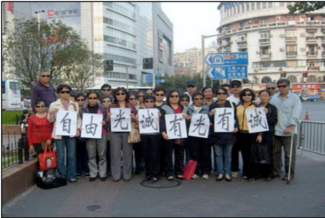
Shanghai residents holding placards which read “To free Guangcheng would bring light and sincerity.”

In the efforts to free Chen, microblogs have been indispensable: