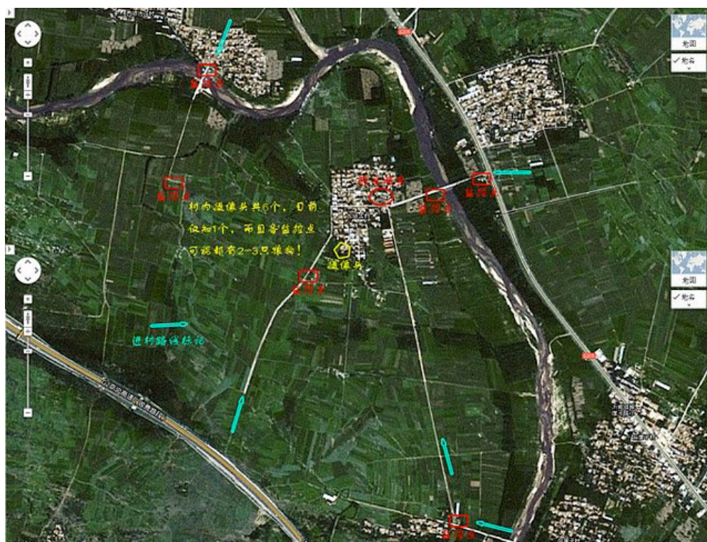
Aerial photo showing the various surveillance points manned by guards (in red) and surveillance cameras (in yellow) in and around Dongshigu Village (settlement in center).

According to CHRD’s research, Chinese Communist Party (CCP) and government officials from Linyi City, Yinan County, Shuanghou Town and Dongshigu Village are directly responsible for Chen’s current conditions of detention. Surveillance points have been set up in front of and behind Chen’s home, and at six other locations on the four roads leading into Dongshigu Village. Additionally, six cameras currently monitor movement in the village, and to the west and east two cell phone jammers have been set up on property belonging to Chen’s neighbors. Reportedly, officials have hired almost 100 men from outside the village as “security,” some of them employees from government offices, to keep Chen and his family under constant surveillance. These guards are divided into two large and 12 smaller groups, and maintain round-the-clock radio communication with each other. Led by Gong Xingjian (高兴见), a man from a nearby village, they are well compensated, receiving two free meals per day and a daily wage of 100 RMB—far more than the average villager is able to earn (the village party secretary’s salary is just 250 RMB per month). 13